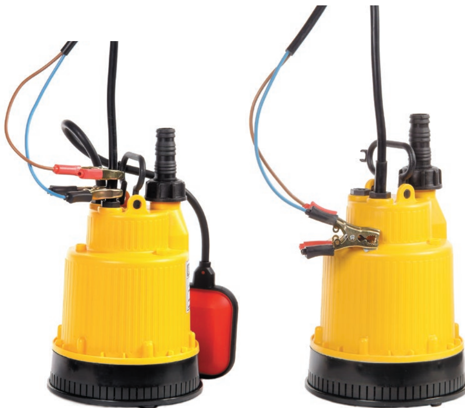
Baby Battery auto